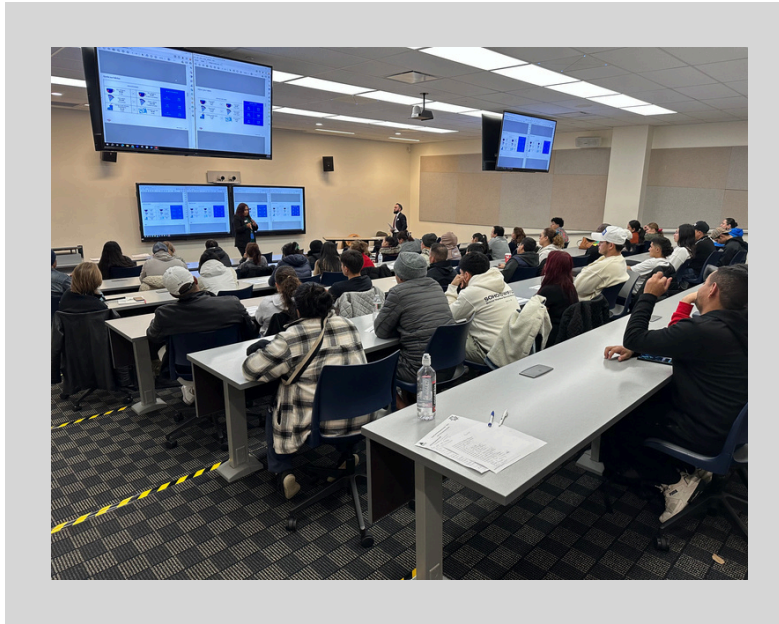
Financial Literacy Workshop, November 2024

We recently had a Financial Literacy Workshop in November for students in our ESL and HSE programs that aimed to empower them with essential money management skills. The workshop covered a range of topics, including budgeting, saving strategies, and understanding credit. Students engaged in interactive discussions and hands-on activities that highlighted real-world financial scenarios. The positive feedback from attendees underscored the importance of such initiatives in helping students make informed financial decisions.