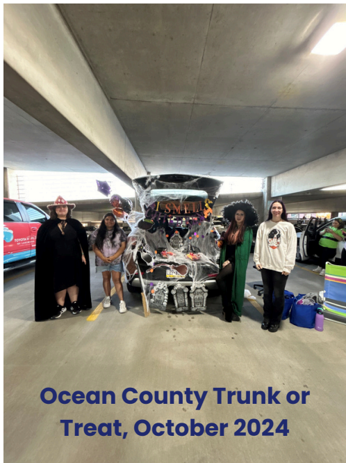
Ocean County Trunk or Treat, October 2024