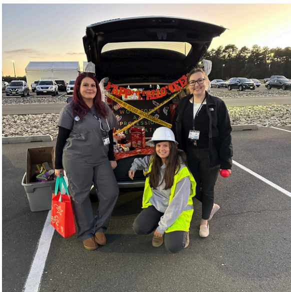
Ocean County College Trunk or Treat, October 2024