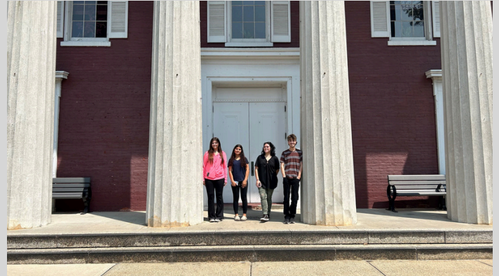
WRAP Ocean County Courthouse Tour