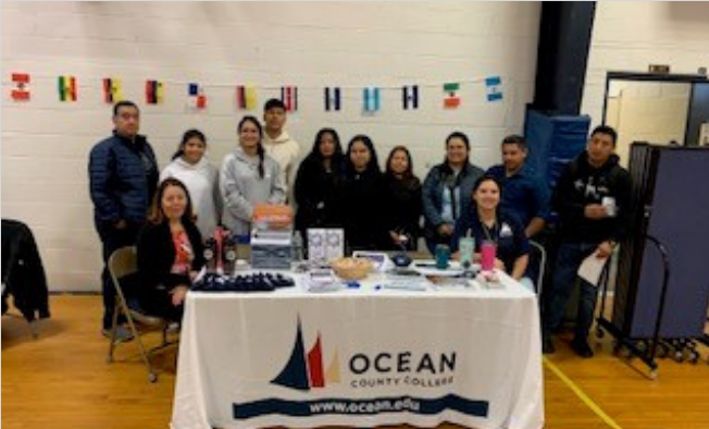
Hispanic Heritage Month Event, September 2024